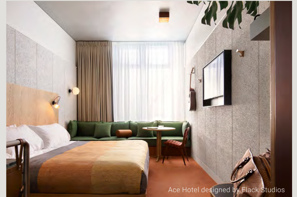
Ace Hotel designed by Flack Studios

Our Mission is to enable Net Zero Carbon design excellence through simple cost effective calculation tools, knowledge and data.