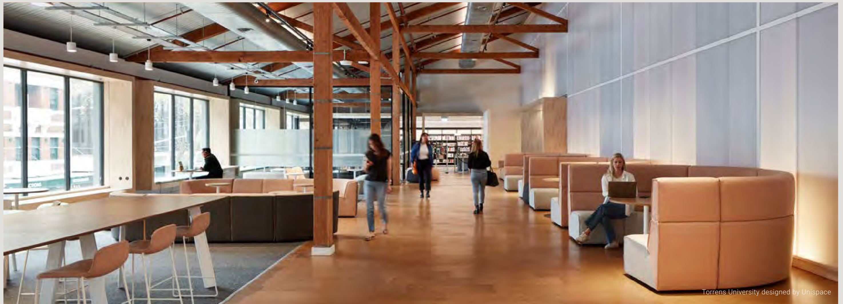
Torrens University designed by Unispace

We study what's been done before and strive to do better to perform on a global stage.