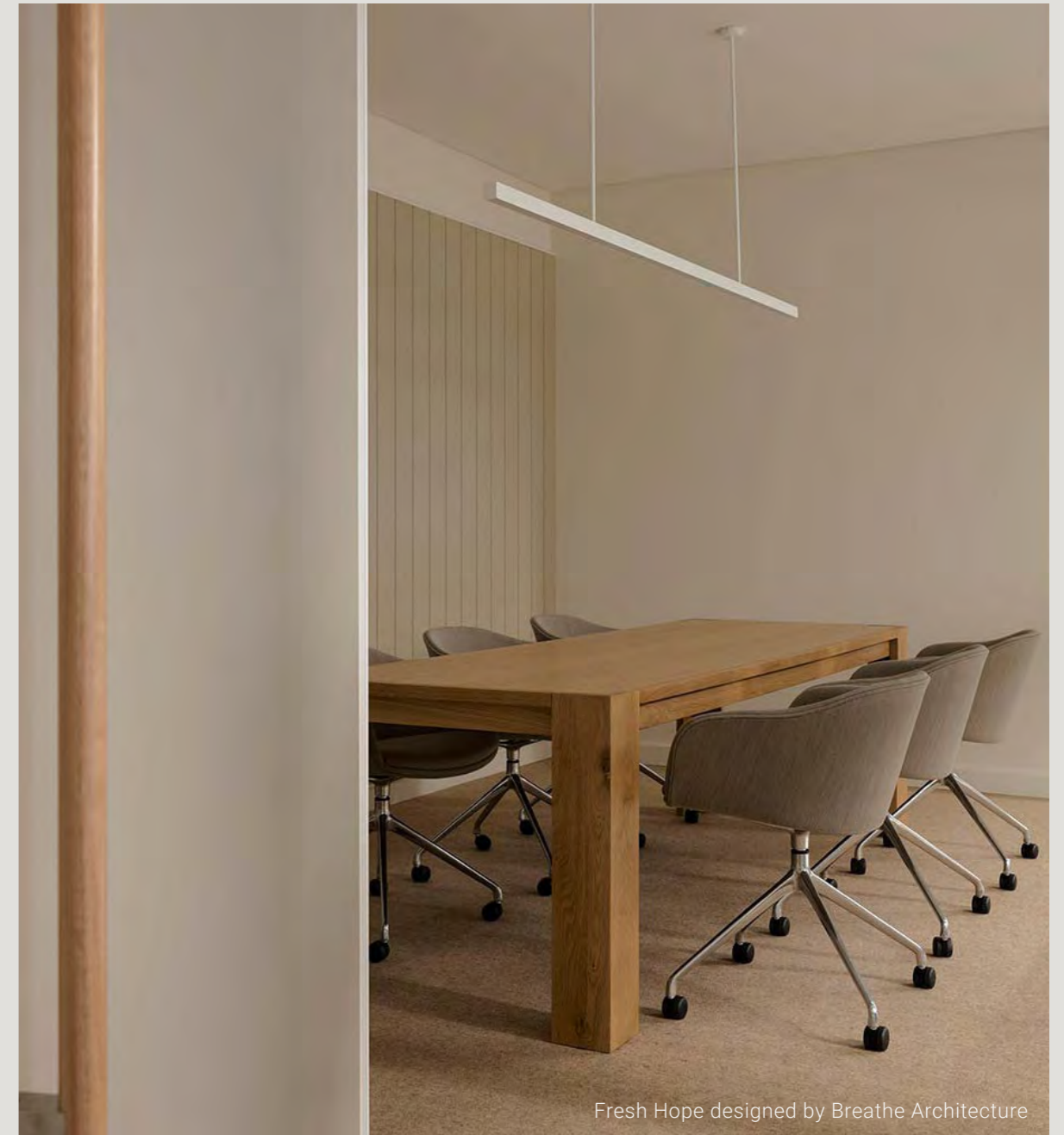
Fresh Hope designed by Breathe Architecture